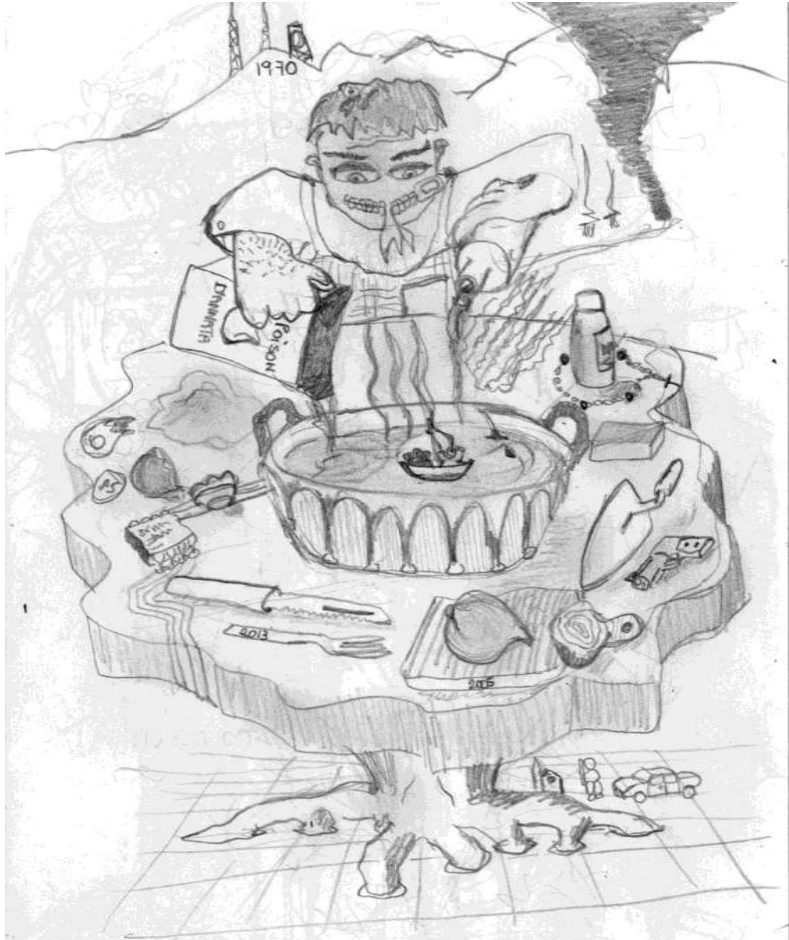
Figura 3: The "Crazy Alchemist ". It's an allegorical representation of the false truth prepared and served to Italian community to explain the facts happened to Barbara and Bruce. The multi-component supper contains prosecutors, police forces, mayors, and Vatican.