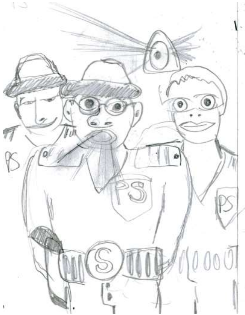
Figura 4 Some members of police were moved against us. On August 2010 an illegal police action caused us to lose home, and since then we are surviving living on makeshift shelters exposed to danger, criminals, famine, warm and cold. No one aided us. Even if there are some laws in order to aid citizen in such condition, mayors refused to apply them! Charities organizations made nothing, the Vatican as well! Police, mayors, and a lot of citizens, all together, were the architects of the infamous operation. The plot was to create the false appearance we are criminal, and to make believe we are lazy and crazy.