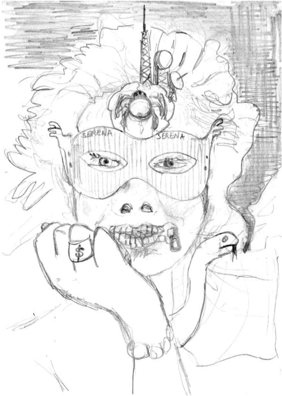
Figura 1 An allegorical representation of Barbara and Bruce's enemy